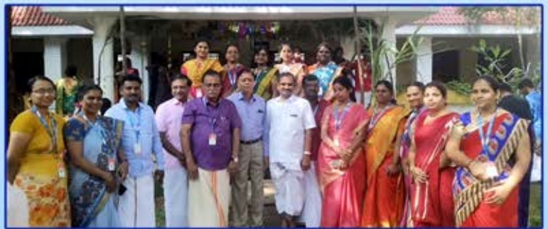
Commerce Family Shot